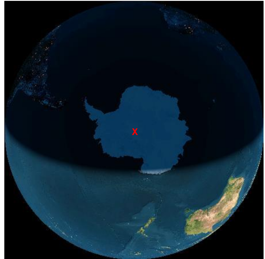
Midnight at the pole 21 st June